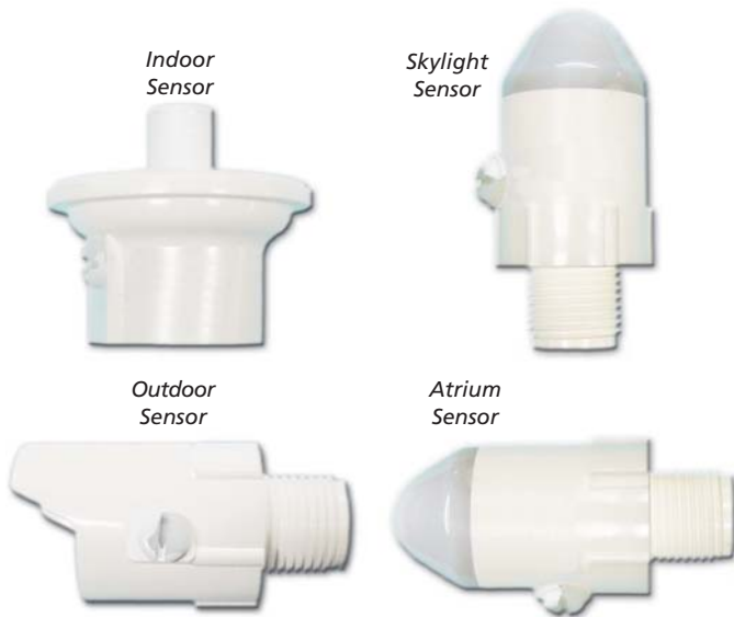
[ CORRECT ORIENTATION SHOWN ]

PHOTODIODE SENSOR WITH 4-20mA Output 2 Wire, Loop Powered, Microprocessor